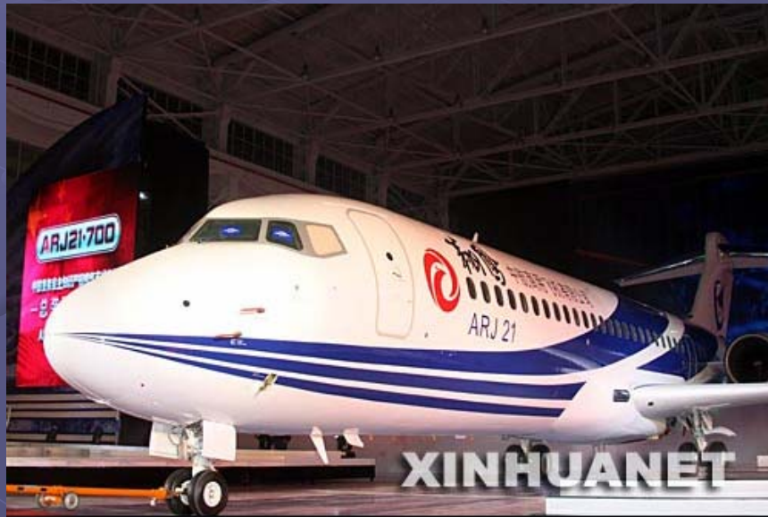
China's first home-grown regional jet - ARJ21-700

The increasing demands of investment castings in the areas of aerospace, energy and so on will promote the growth of its technical level and production scale.