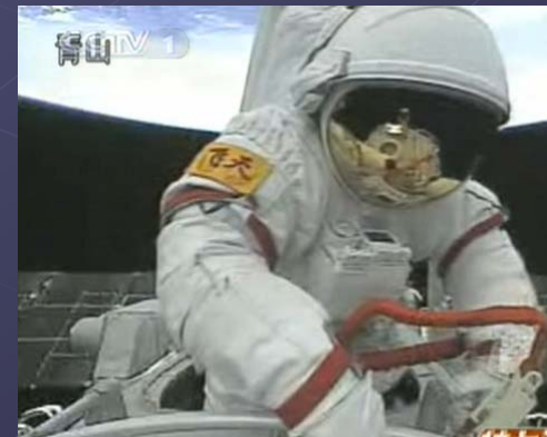
Shenzhou VII spacecraft